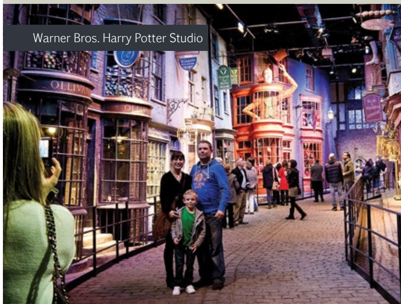
Warner Bros. Harry Potter Studio

Our programme is full of excursions and activities in order to immerse our students in the English culture. The English lessons are a mix of tradition methodology and modern technology. All the classrooms have interactive smartboards, controlled with Ipads, and are all linked via Apple TV. There is free WiFi across the campus.