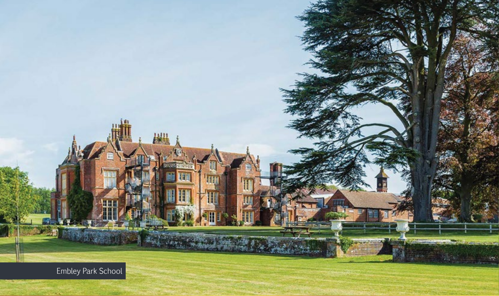
Embley Park School