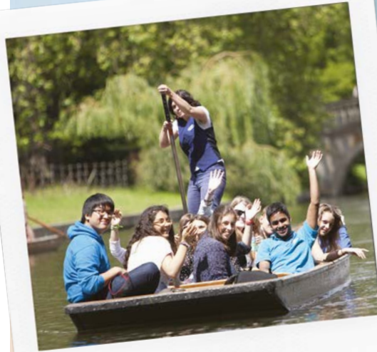
Punting in Cambridge